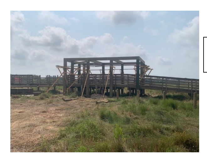
Boardwalk Roof During Construction