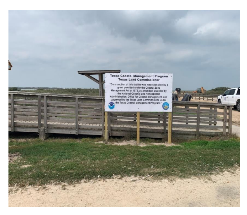
Task 3: Project Monitoring & Reporting

All monthly reports were submitted in a timely manner.