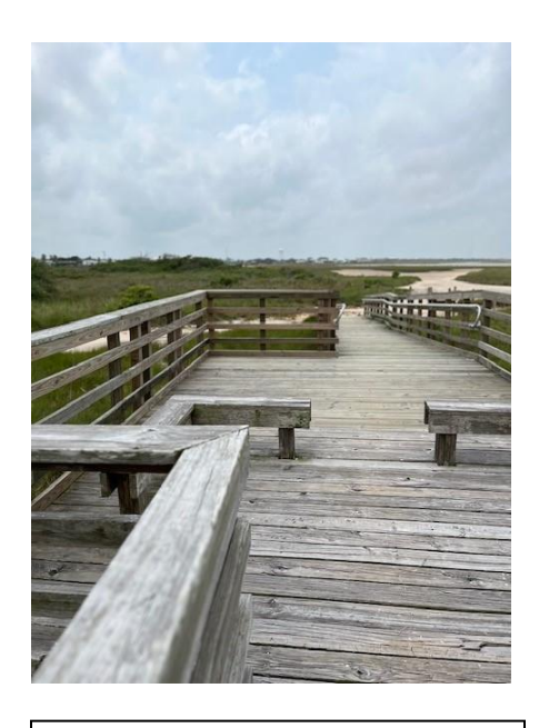
Boardwalk – Before Construction

still completed on time. The enhancement of the boardwalk roof is such an asset to this project. The bird watchers will now be able to have some shade and protection if they happen to get caught in the rain.