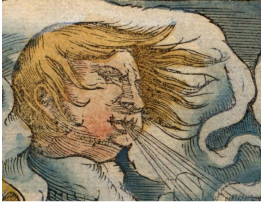
Detail from GLO Map #96566