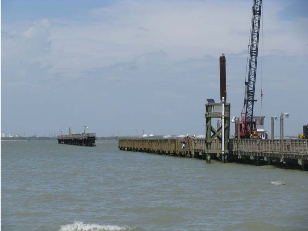
292 feet of new construction for Cycles 11, 12 and 13.