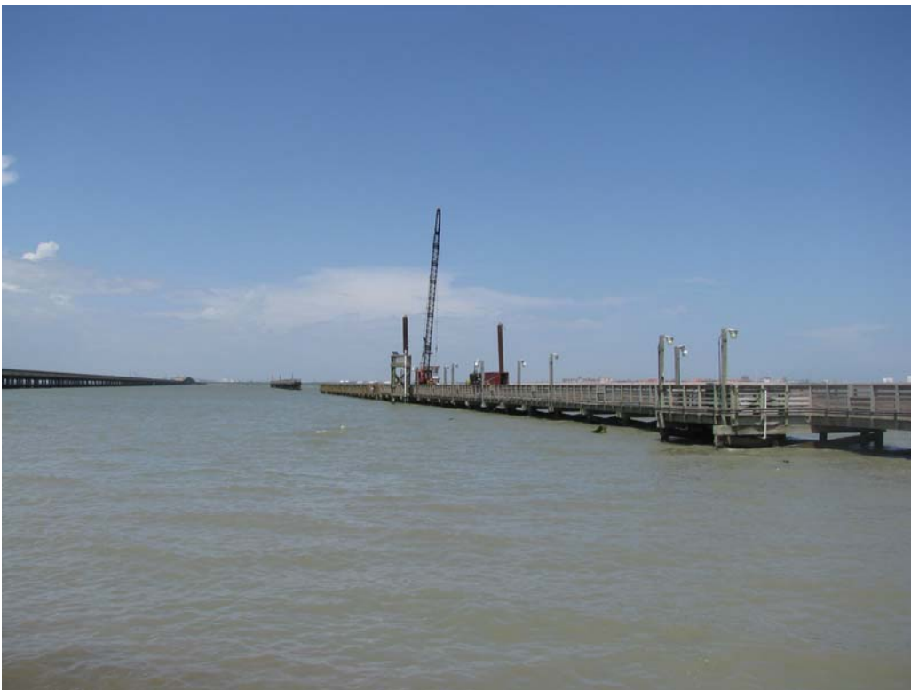
View of construction completed during CMP Cycles 8, 9, 10. New construction For Cycles 11, 12, and 13 begins at the crane on the barge.