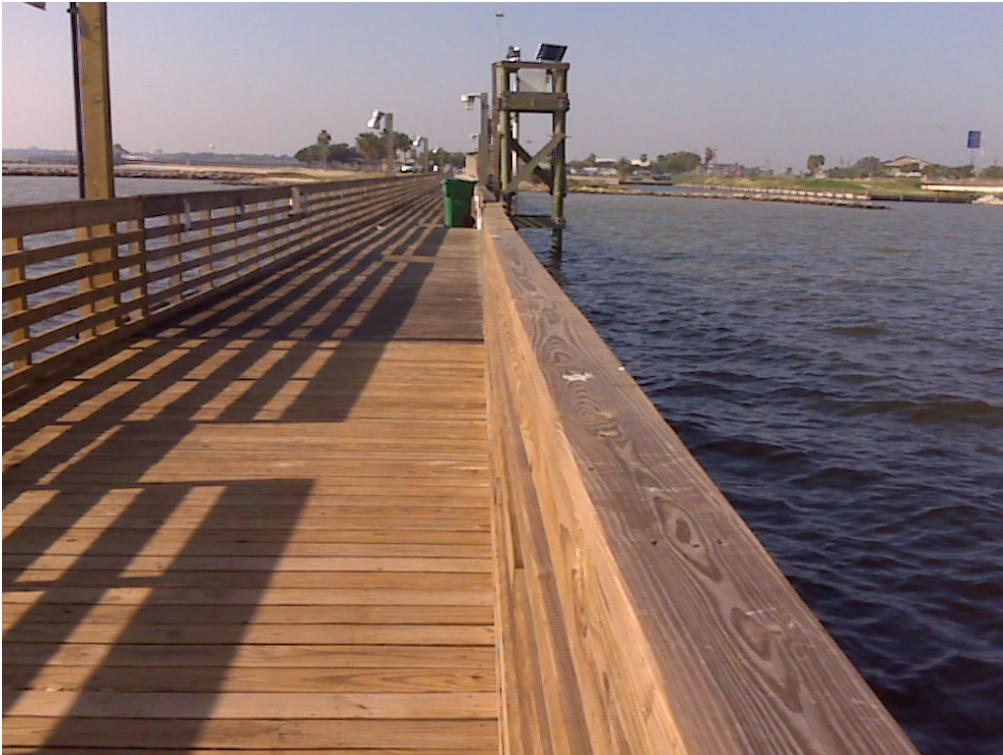
Looking back toward the park.