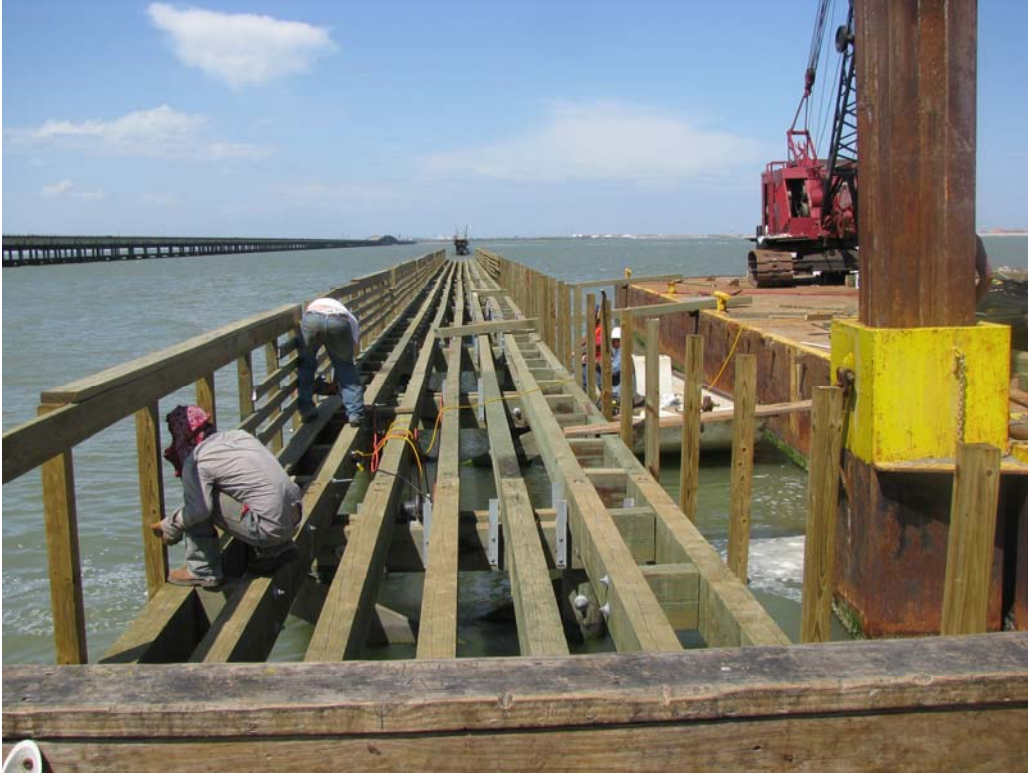
Close-up view of construction work.