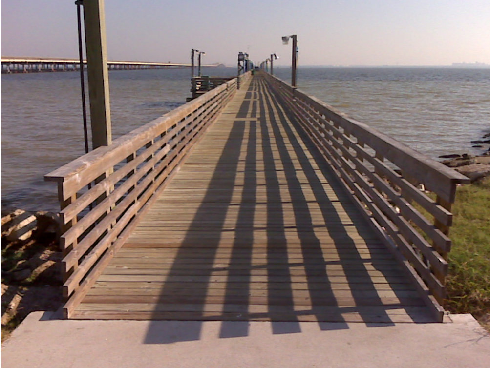
View of pier from the shoreline.