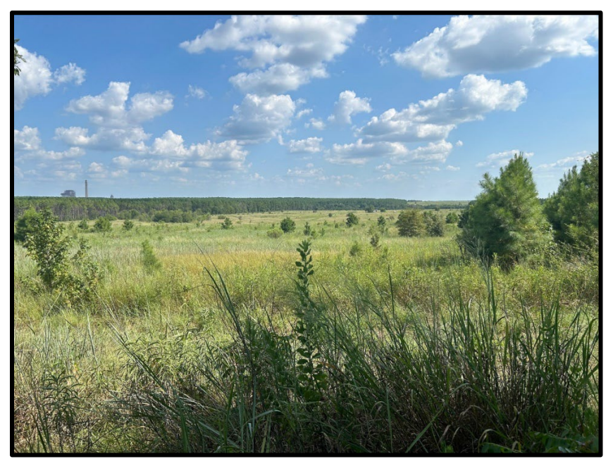
64 Acre - Blankenship Survey, Abstract 71