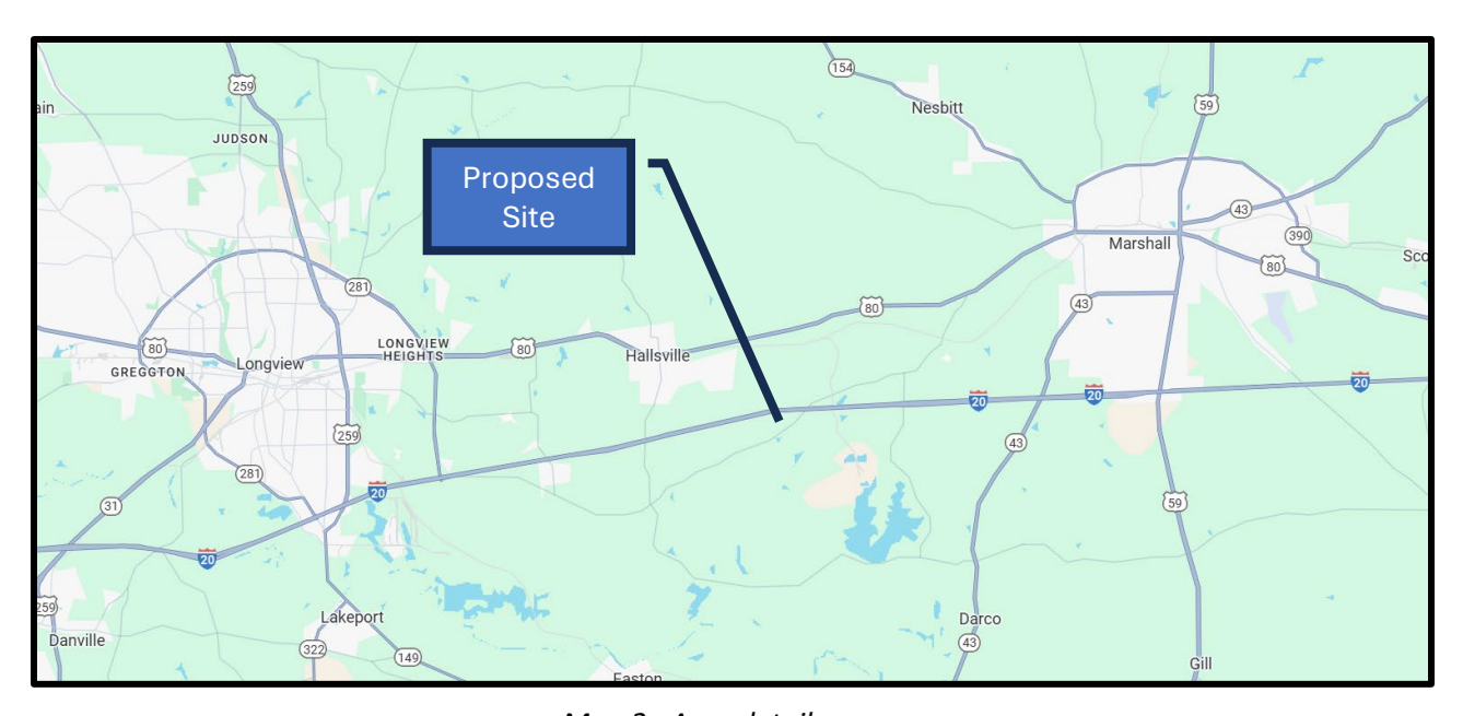
Map 2: Area detail map.