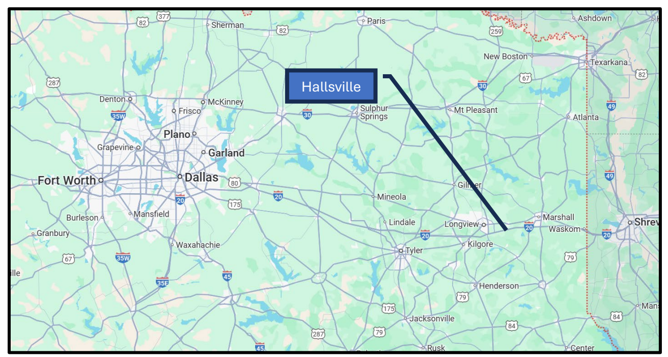
Map 1: Hallsville in relation to Dallas/Fort Worth Metro Area

The 64-acre tract is in northeast Texas in Hallsville, approximately 12 miles southeast of Longview. Map 1 indicates the location of Hallsville in relation to the Dallas metro area. Map 2 shows the local area.