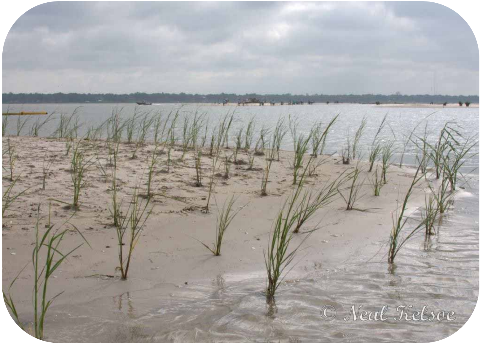
Mounds planted at Marsh Mania