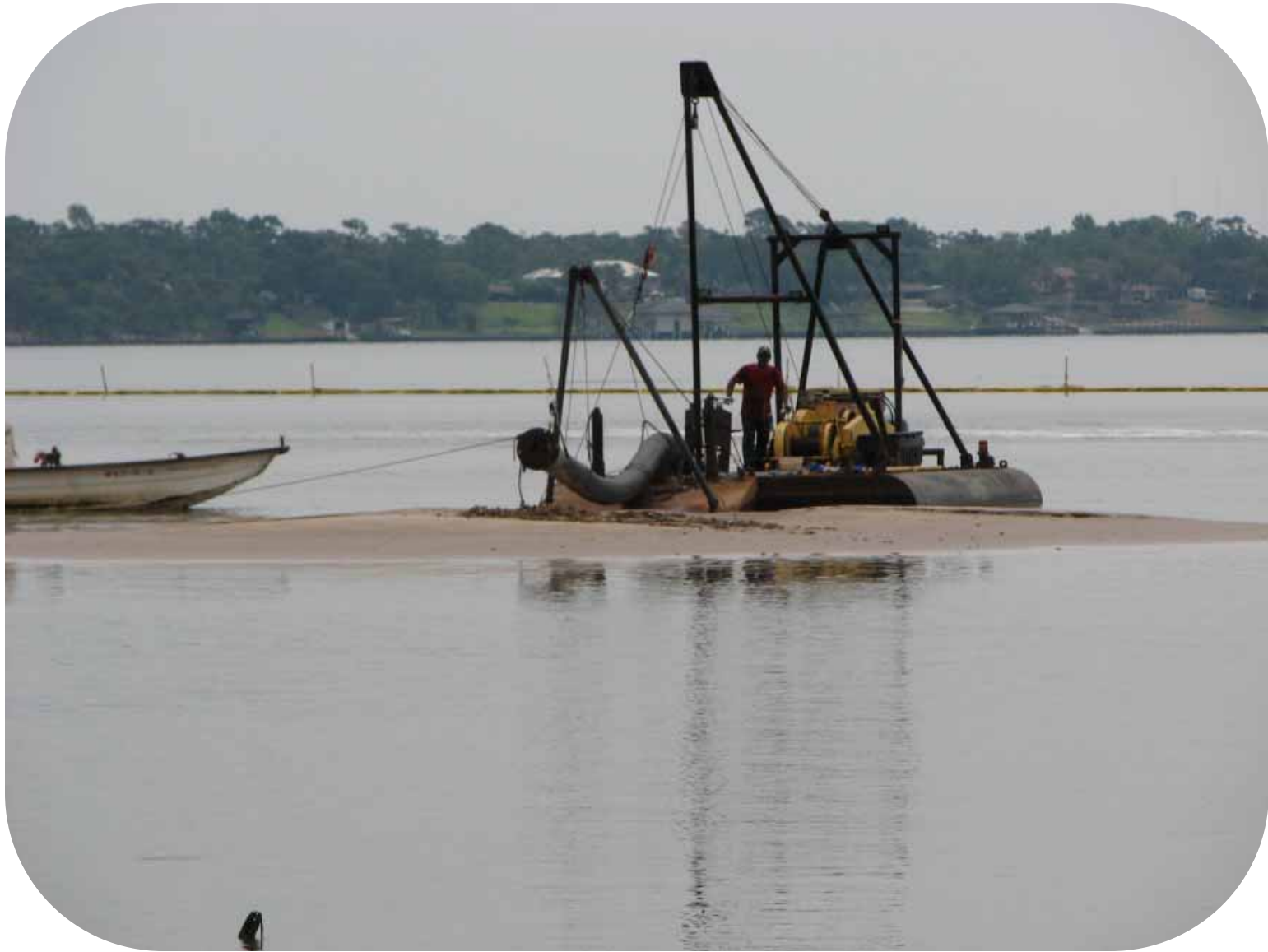
Contractors prepare the dredge pipe prior to starting the dredge.