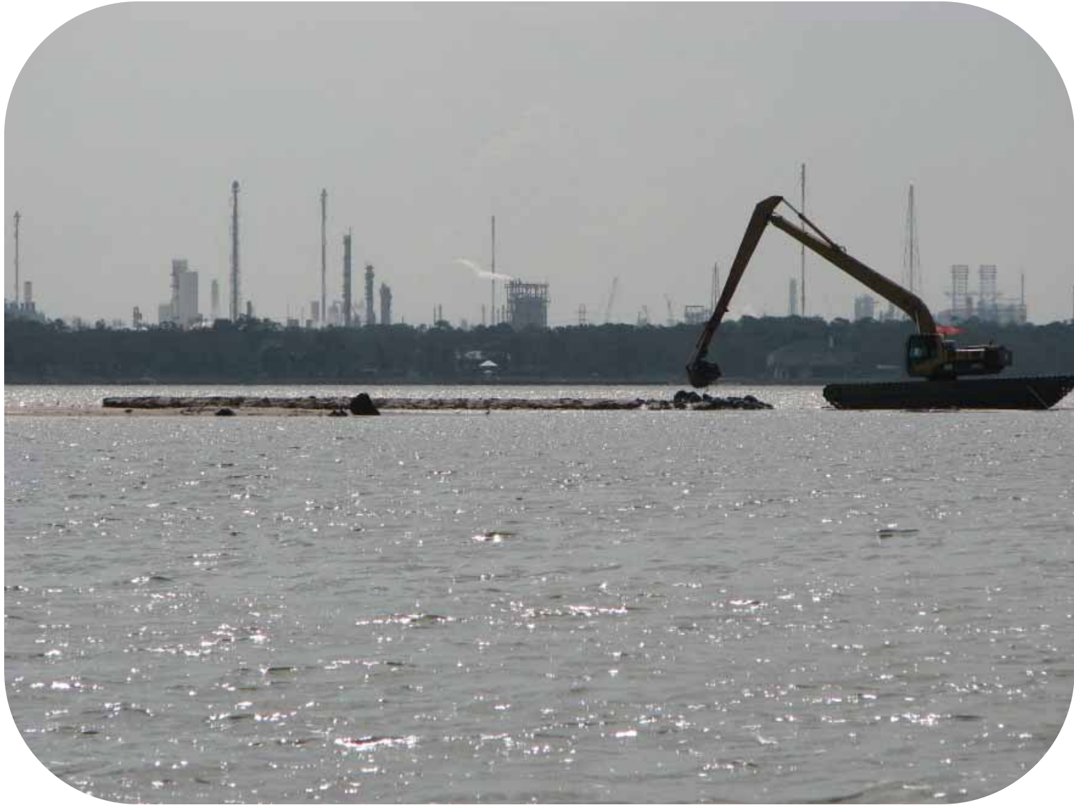
A track hoe constructs earthen berms.