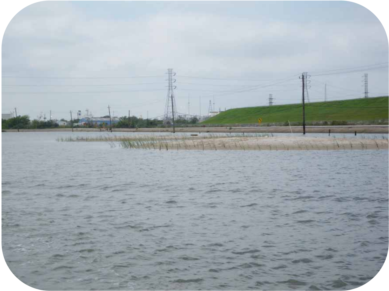
Mounds planted at Marsh Mania