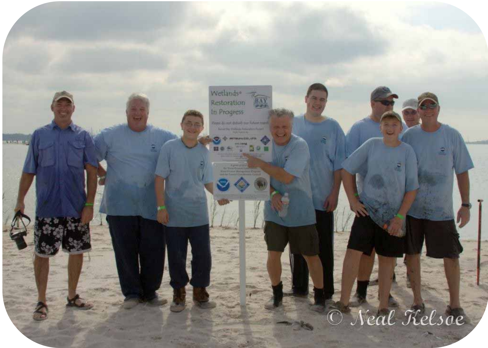
After a day of planting, ITC employees proudly point to the ITC logo on the project partnership sign.