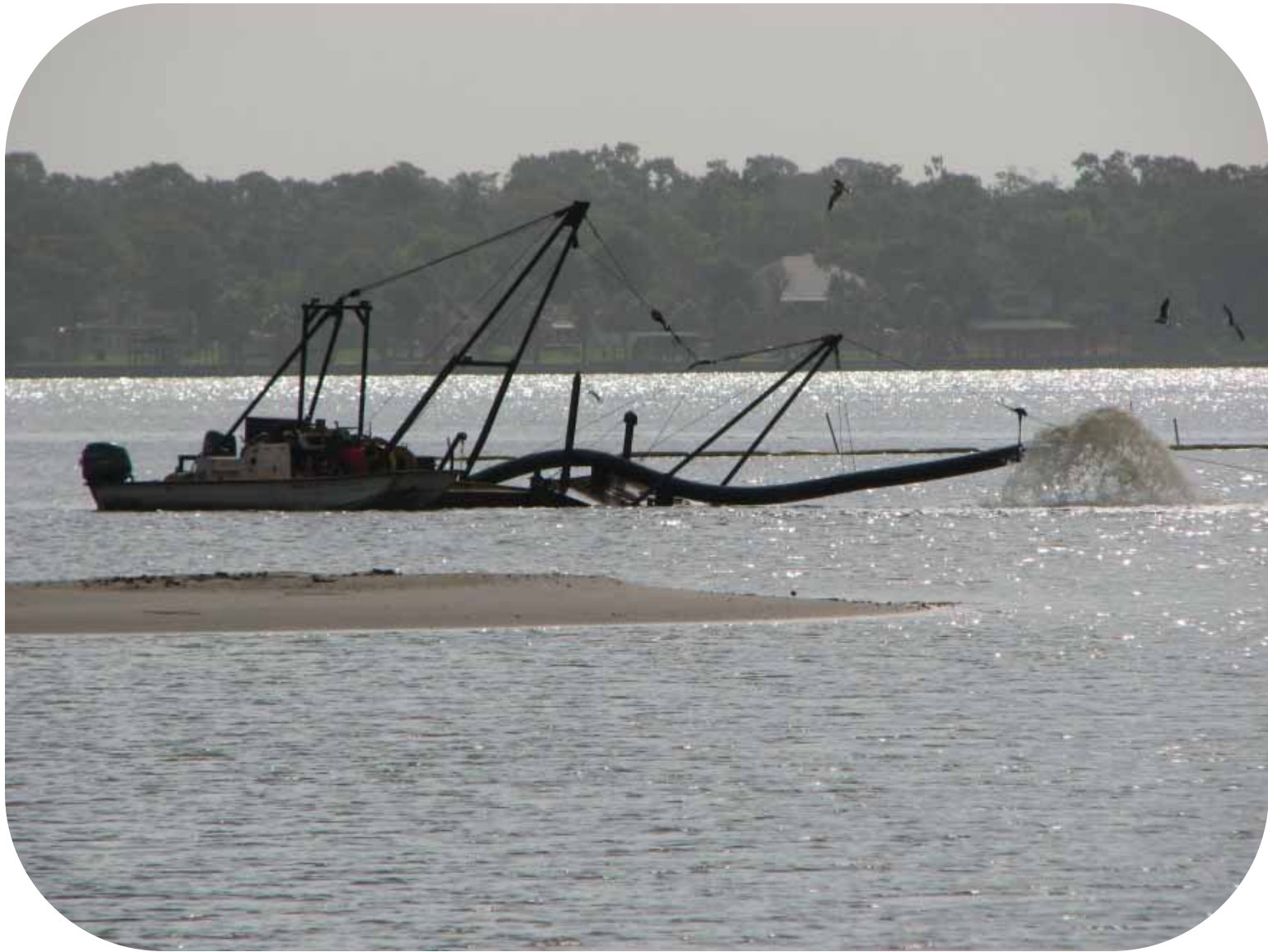
After first starting the dredge, water is pushed through the pipe.