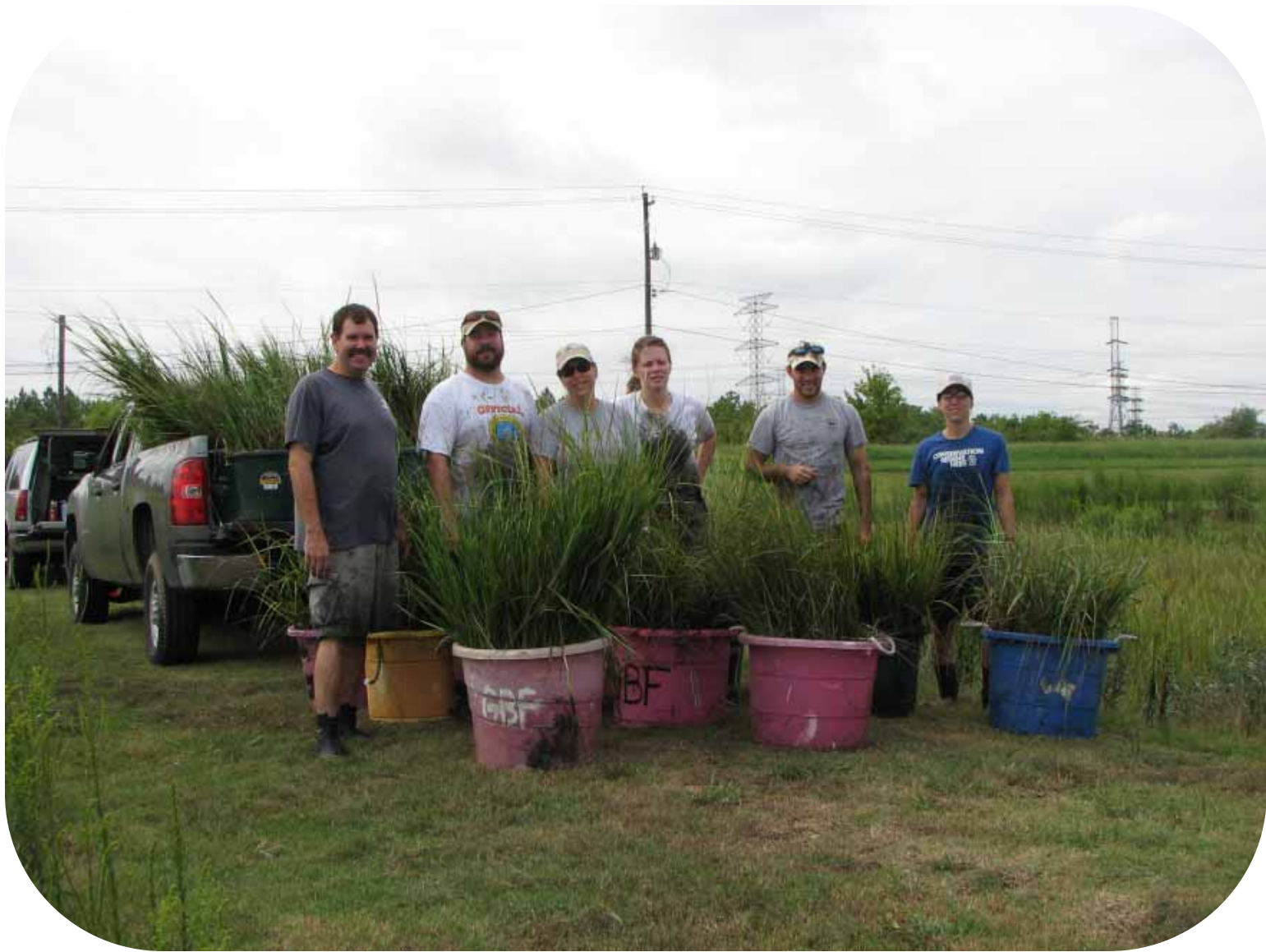
The harvesting crew consisting of GBF, USFWS, and NRCS