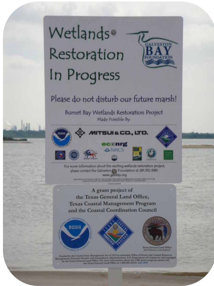
Project partnership and CMP signage placed on site.