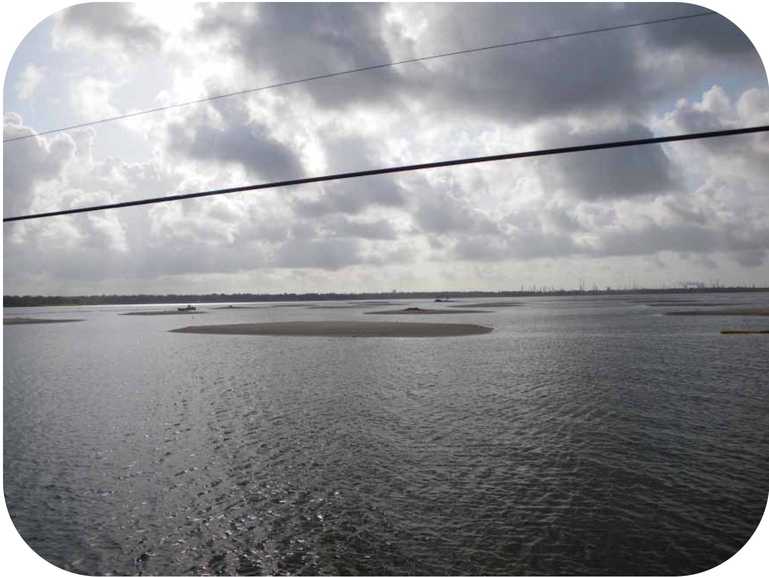
Completed mounds on the north side of the peninsula.