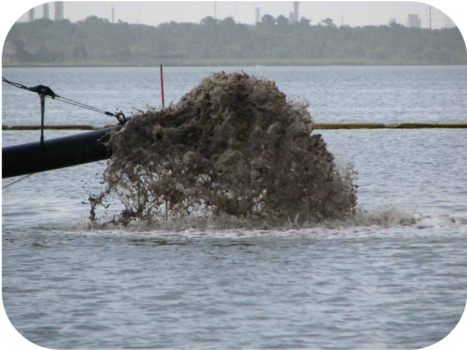
Close up of material being pushed through the pipe to create mound.