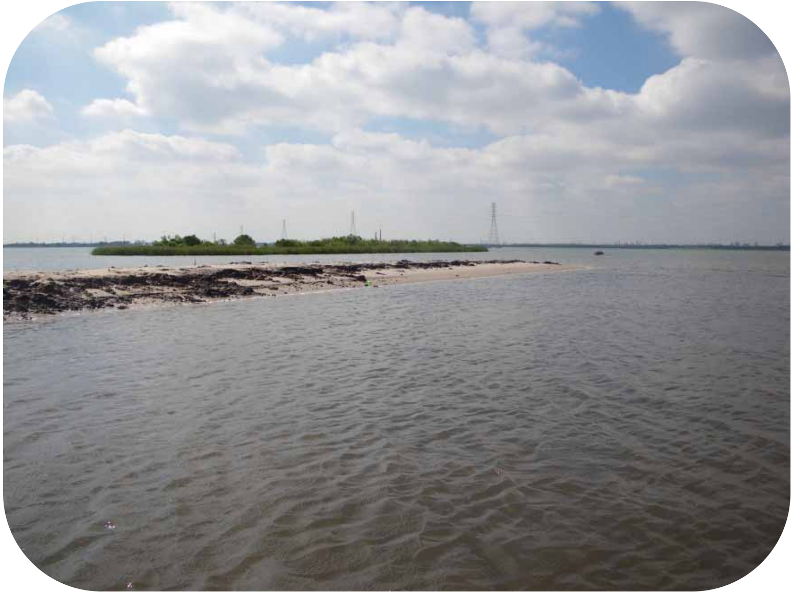
A section of earthen berm