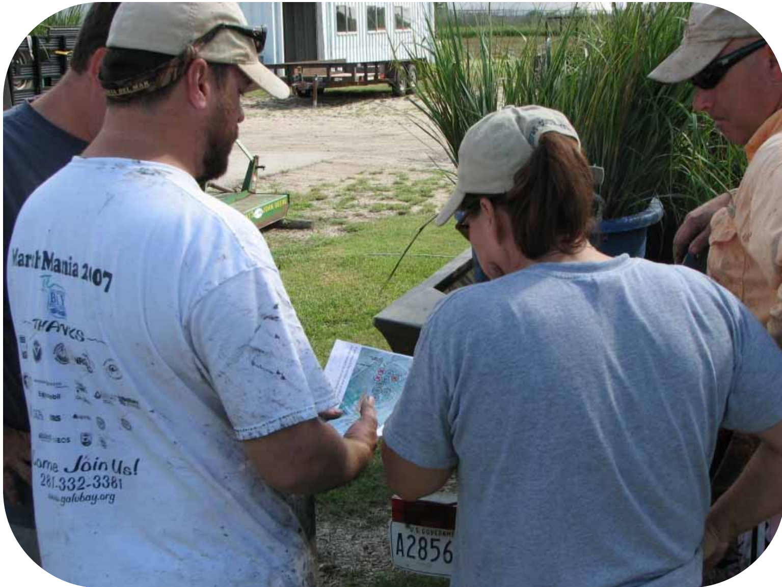
GBF project manager goes over Marsh Mania game plan with boat captains and team leaders.