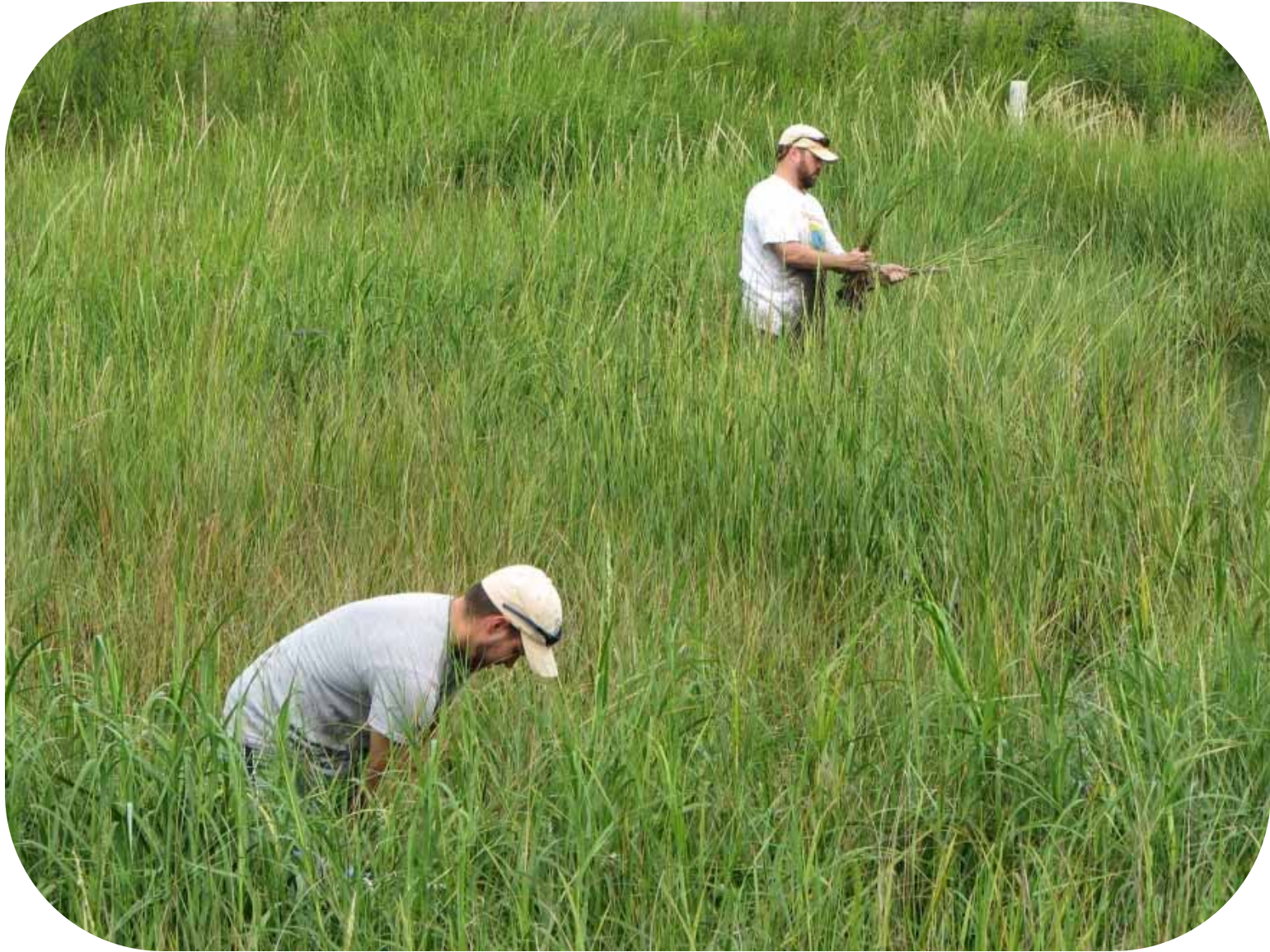
GBF staff harvesting cordgrass from NRG's Eco-Center, Baytown, TX