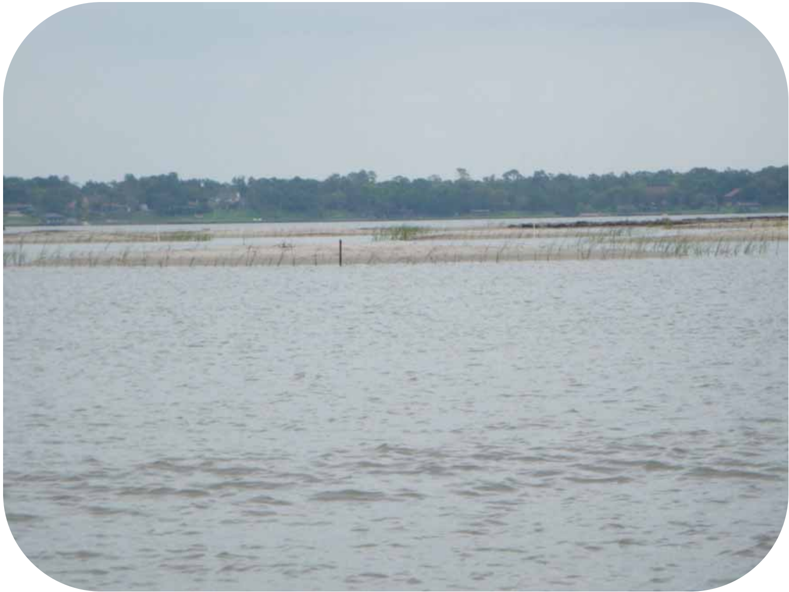
Mounds planted at Marsh Mania