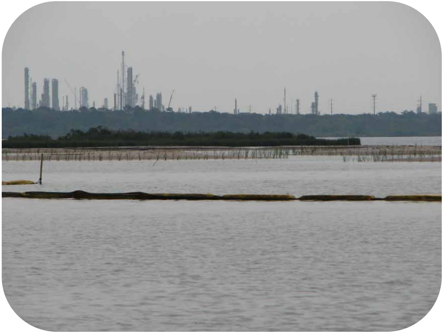
Mounds planted at Marsh Mania