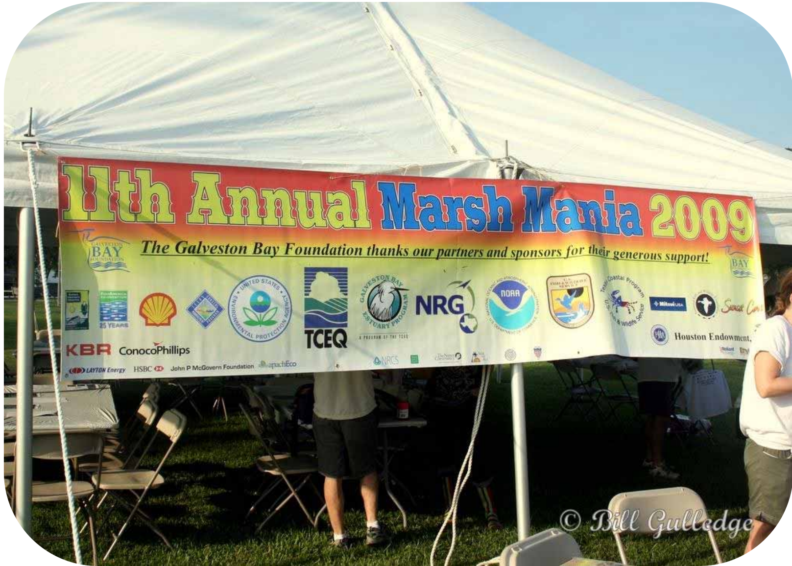
Marsh Mania banner recognizing MM sponsors including CMP and NOAA