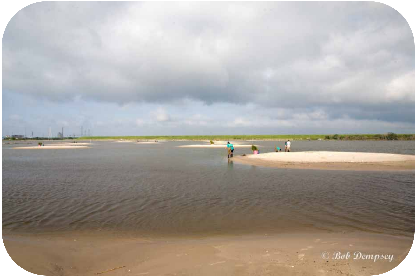
Mounds prior to planting day of Marsh Mania