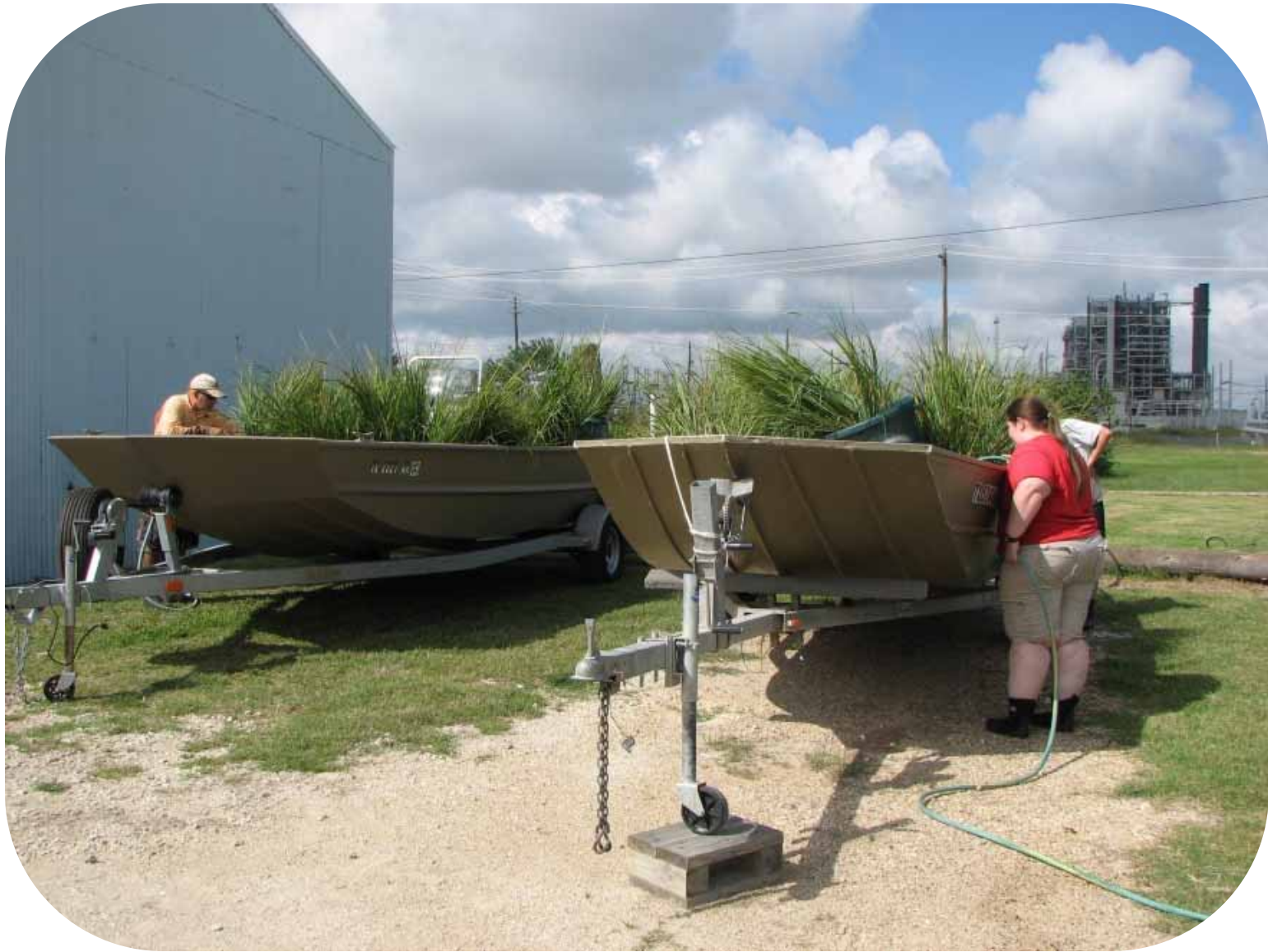
Harvested plants loaded on boats for Marsh Mania