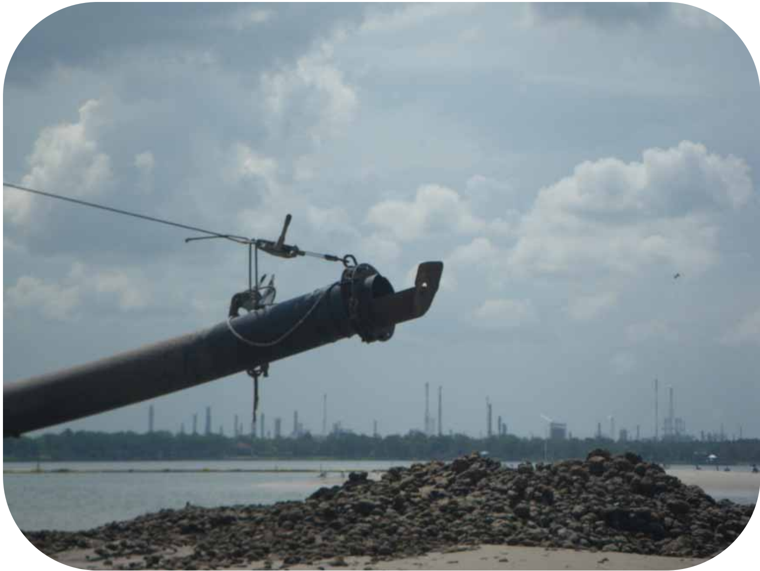
A spreader is placed on the end of the dredge pipe to allow material to flow in all directions from the pipe.