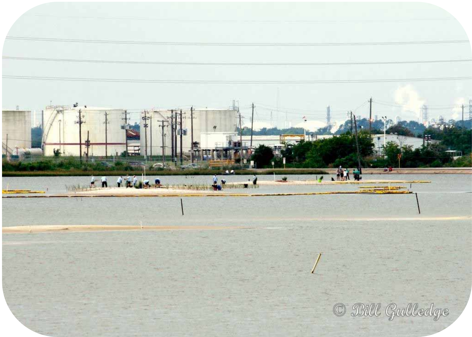
Volunteers completing the planting of the first mound at Burnet Bay!