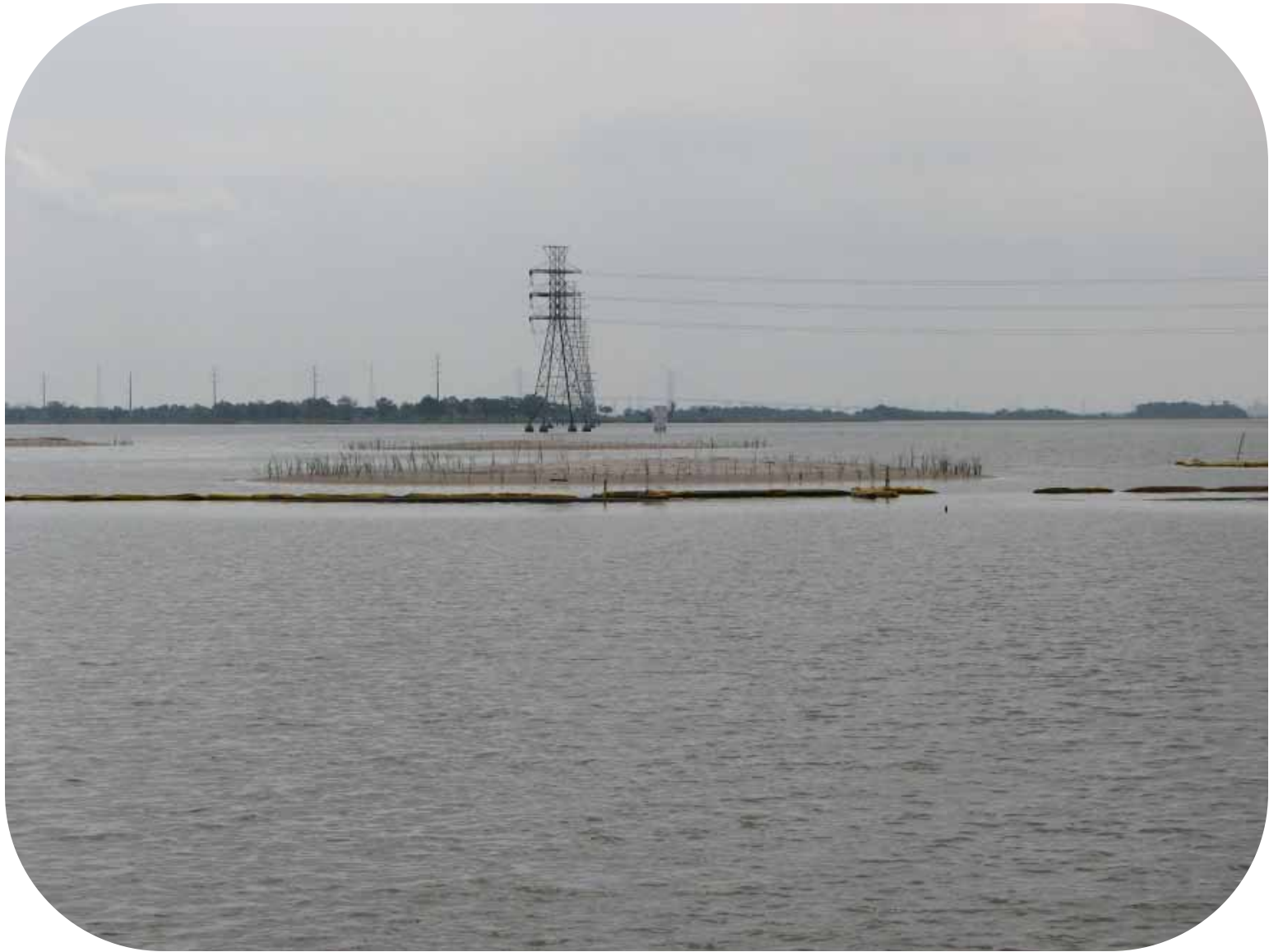
Mounds planted at Marsh Mania