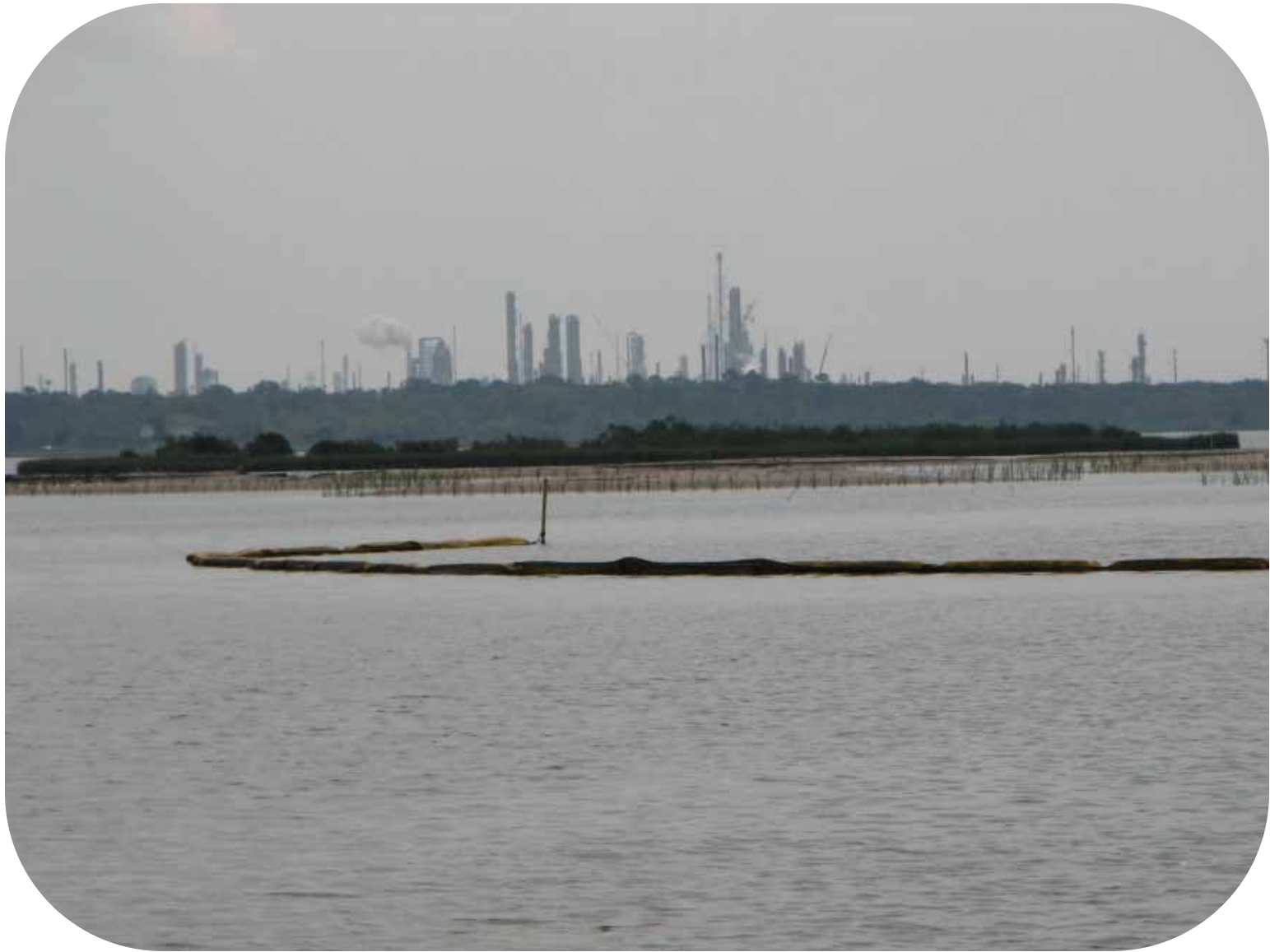
Mounds planted at Marsh Mania