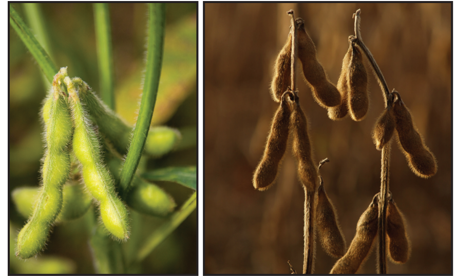
Green soybeans and soybeans ready for harvest

At the end of the season when the plant is mature, the ideal situation is simultaneous leaf and pod yellowing. However, in some situations leaves may remain green after the pods have reached maturity. Leaves and stems remaining green after the seed and pod mature can interfere with harvest.