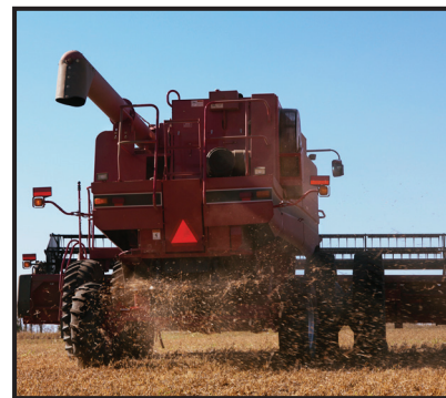
A combine harvesting soybeans

When checking for field losses, an average of 4–5 beans per square foot equals about one bushel per acre loss. To obtain a good sample, soybeans in 10 square feet should be counted. Take several random samples and average them to find the average and divide the average by 50. For example, if an average of 75 beans is found within the 10 square feet, the field loss is 1.5 bushels per acre ( 75/50 = 1.5 ).