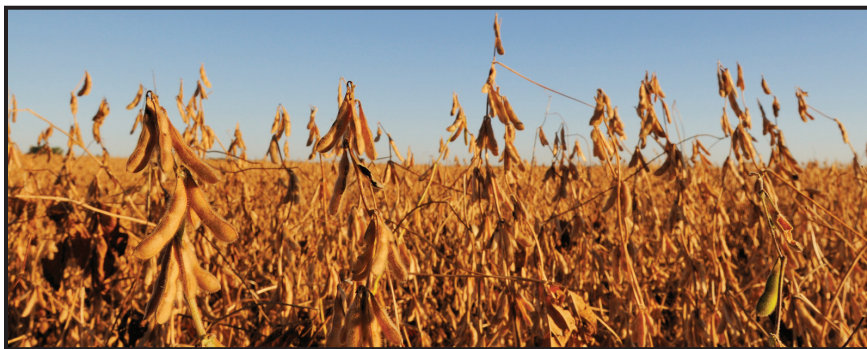
Soybeans ready for harvesting

yielding beans, the reel axle may need to be moved directly over the cutter bar. Reel bats should leave beans just as they are cut. Reel height should be just low enough to control the beans.