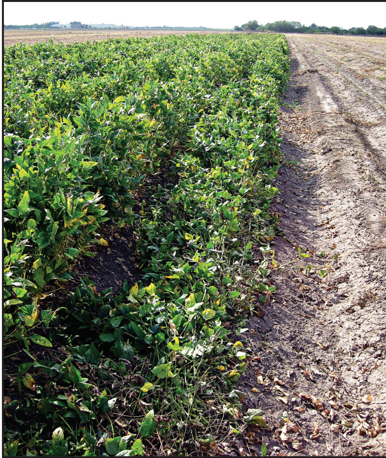
Soybean plants in the Rio Grande Valley