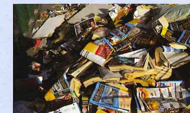
Directories waiting for processing at McAllen Recycling Center.

Businesses and individuals were urged to take their old phone books to collection centers in Alamo, Alton, Brownsville, Edinburg, Harlingen, Pharr, San Juan and Weslaco; and San Benito City Hall. An estimated 12.59 tons of directories were collected from March 1 through March 31, 2011.