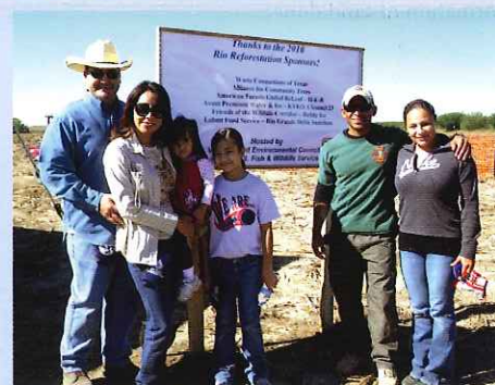
Family participates in another successful native tree planting project has helped to restore more than 746 acres of habitat.

Restoring native habitat is critical in an area where only about five percent of the original remains. Reforestation helps protect native plant and animal species, and supports ecotourism and birding. Valley Proud has been an active participant in this habitat restoration for sixteen years. This