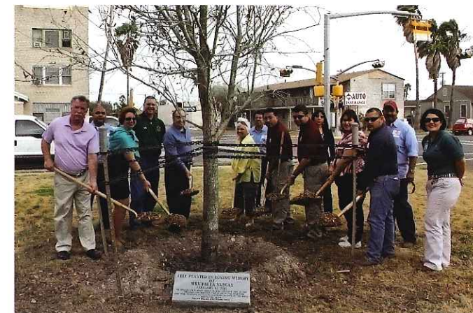
Community members attend Keep Harlingen Beautiful Arbor Day ceremony.

a free comprehensive guide for planning and holding Arbor Month ceremonies.