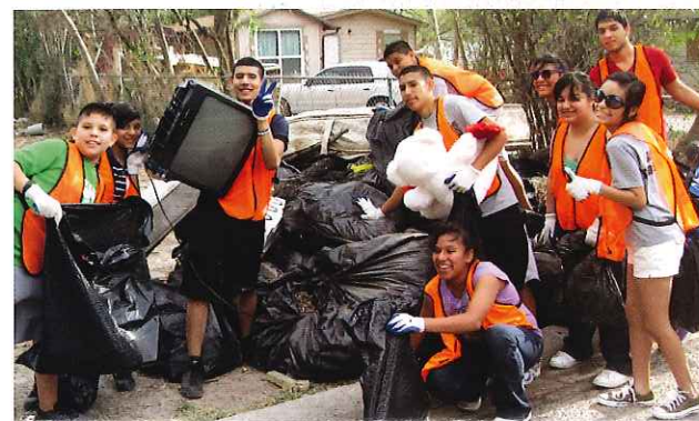
City of Pharr Trash Bash volunteers did a great job of cleaning up the community.

Now in its twenty-first year, the Trash Bash continues to lead the way in cleaning up roads and streets, alleys and drainage ditches all across the Rio Grande Valley. The All Valley Trash Bash has since been