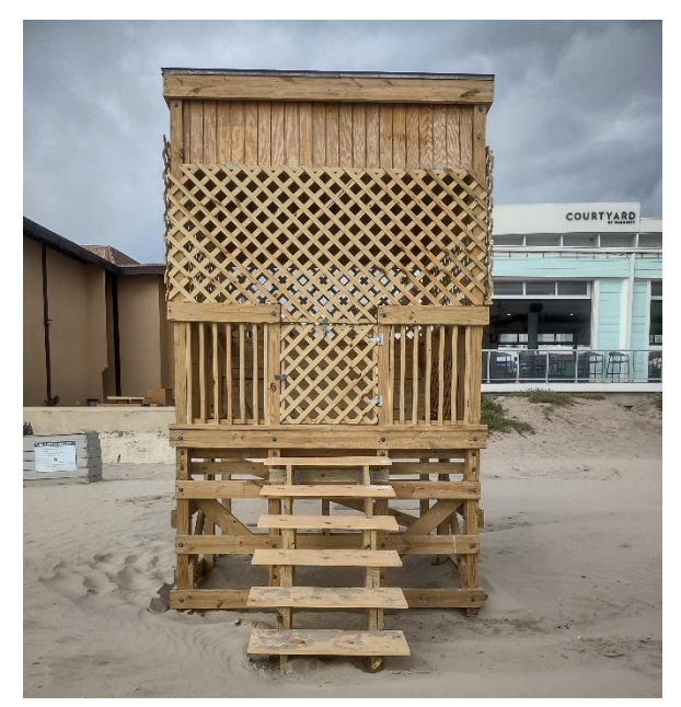
Figure 3. Preliminary Additions