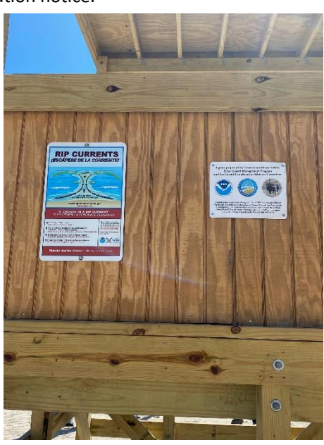
Figure 5. Signage

Final approval, design, and placement of the towers passed on September 7<sup>th</sup>, 2021. One tower was built to the scope and submitted for approval. Once the final design in Figure 4 was sanctioned, the remaining towers were built to that standard. All placement locations of the primary map stayed consistent and no tower has been relocated from its original space. Towers were built to be moveable for any high tide or storm surge events, the towers will be lifted off the beach and placed for storage till they are safe to return. All signs have been posted for beachgoer information.