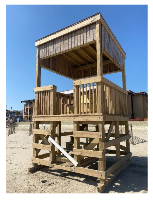
Tower 2 South Claytons