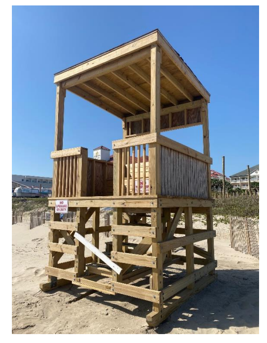
Tower 1 North Claytons