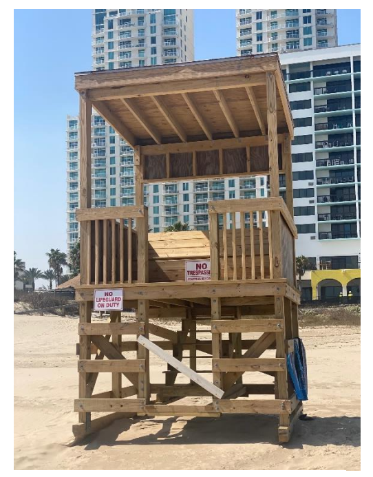
Tower 6 Sapphire