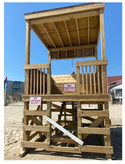
Tower 3 Wanna Wanna