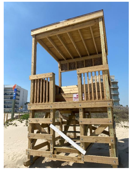
Tower 4 Coco Beach