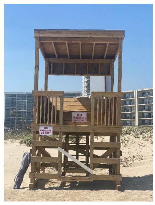
Tower 5 Saida