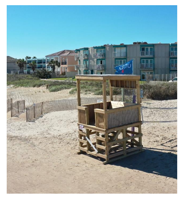
Figure 4. Final Build

Signage is a key part of public safety and regulations. The front of each tower hosts a lifeguard off-duty sign when procedures are not taking place. The back of the tower shown in Figure 5 holds three signs which include rip currents, a flag warning system, and the GLO/NOAA funding allocation notice.