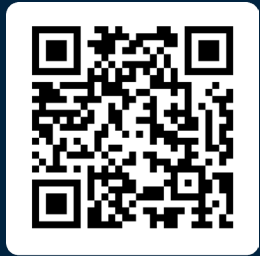
SIGN UP FORM